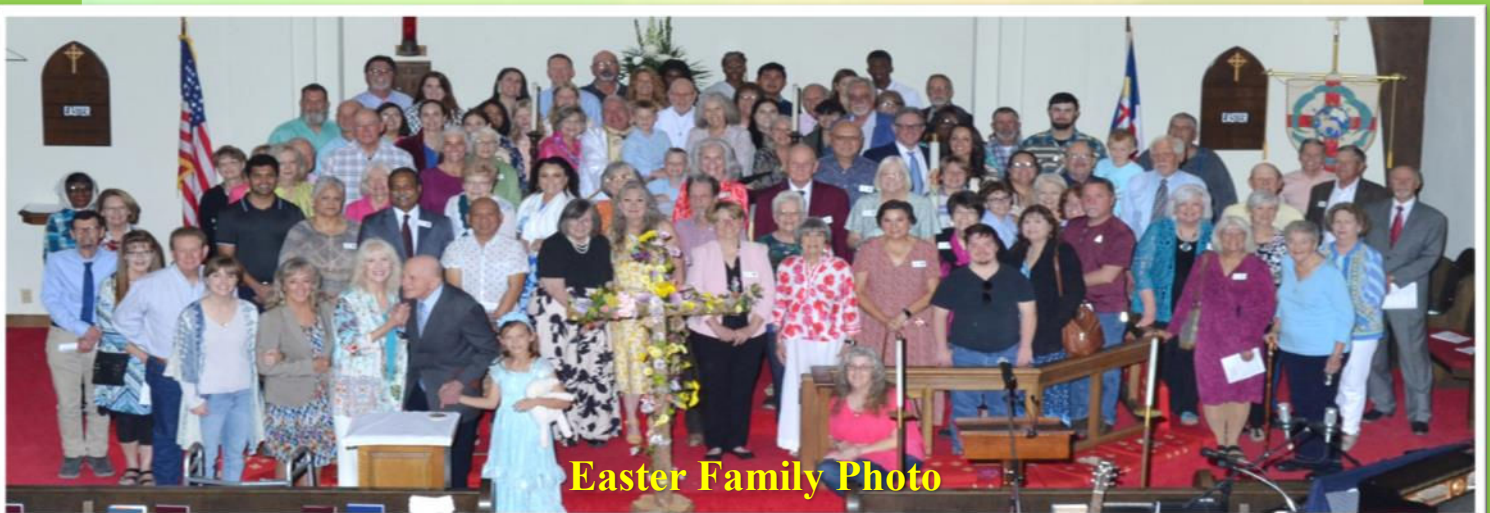
Easter Family Photo